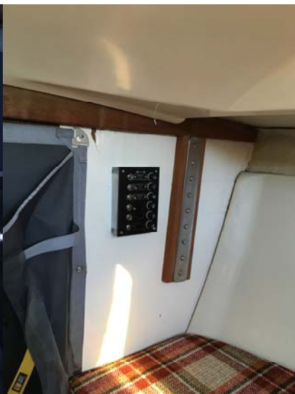
Starboard Fwd Quarter (Elec. Panel)