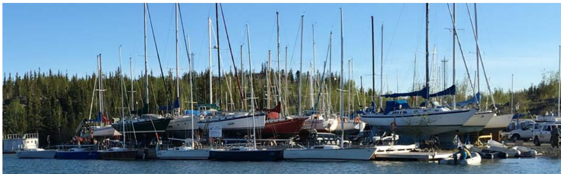
(Kirby Lift-In June 2, 2016 - Stonkin', No Egrets, TCOB, Knot Crazy, Armadillo, Muppet Show missing from photo Carpe Diem)

Here is your opportunity to join our growing Yellowknife fleet of Kirby 25 Sailboats. We currently have the largest one-design fleet in the north with seven Kirby 25 sailboats based out of the Great Slave Sailing Club. Rumour is number eight is on it's way up the highway this spring.