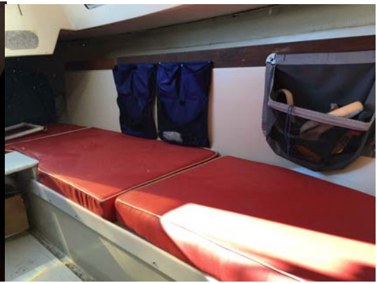
Port Aft Quarter (swim ladder stowed)