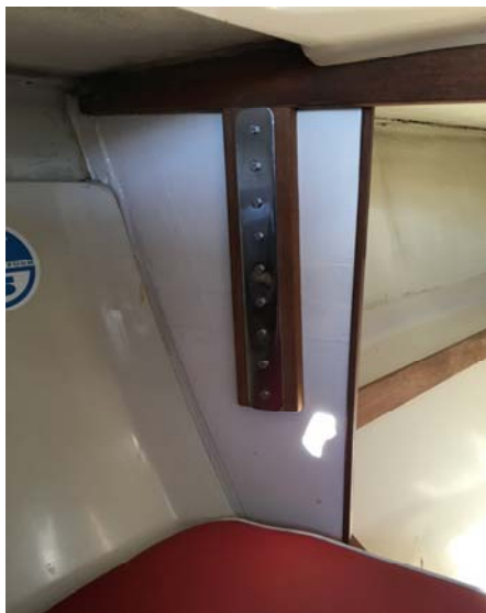
Port Fwd Quarter (upgrade chain-plate)