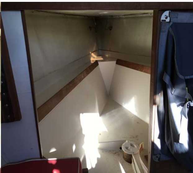
Looking Forward ample storage