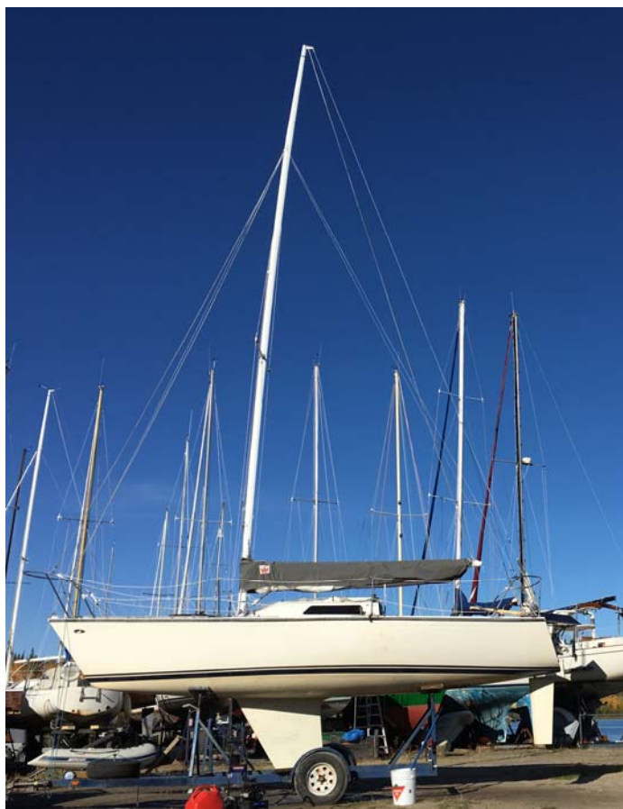
(September 28, 2016 - GSSC Yellowknife)

Join in on the fun with our Wednesday night and weekend races throughout the summer.