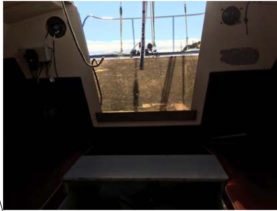
Looking Aft Lower cover in place