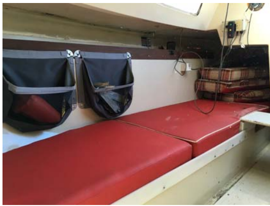
Starboard Aft Quarter (Spare Cushions)