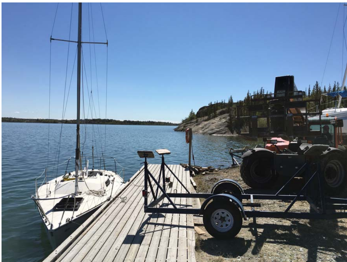
Just launched from trailer with zoom boom.